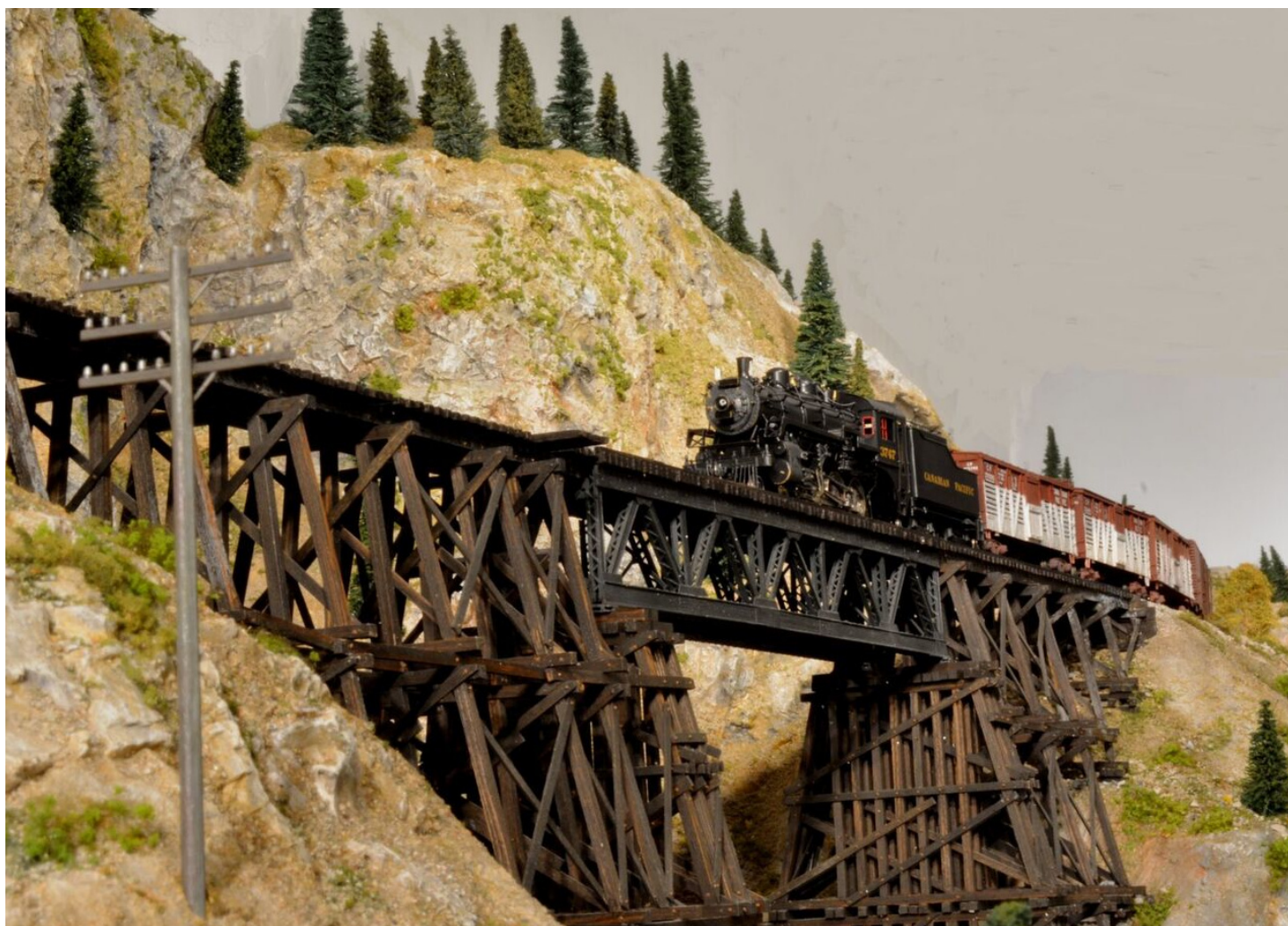
ABOVE: A westbound freight crosses the Bridal Falls Trestle in the Upper Coquihalla Canyon on Anthony Craig's Kettle Valley Division. This layout will host a operating session in the upcoming Railway Modelling Meet of BC.